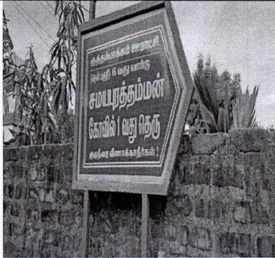
STREET BOARD VIEW