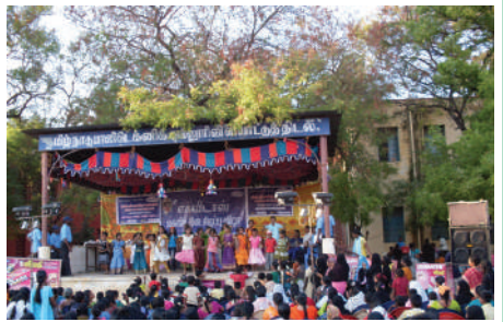
Women's Day celebration at Tamil Nadu Polytechnic College, Madurai in 2010