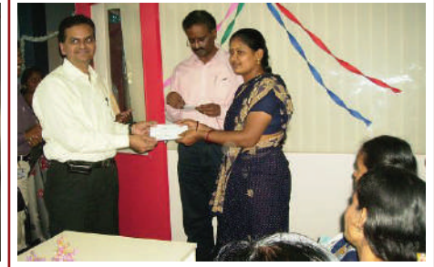
Trainees of the Equitas Gyan Kendra being awarded Certificates of Excellence in 2010